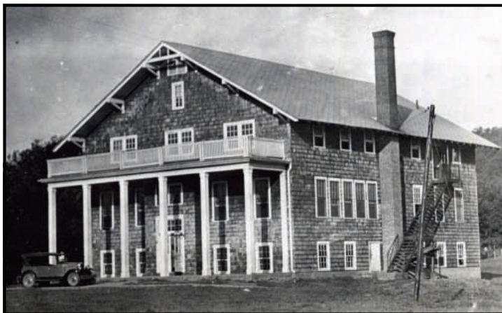
The Heritage Center in 1917

FPC Stillwater also had a hand in fixing a leak in the roof, as well as re-screening the entire porch area. And now that the porch area has been re-screened, we are looking for some volunteer groups to help out with the porch area. There is a lack of seating right now, and with the large screened-in porch, the space is perfect for some Adirondack style seating. We are looking for help with materials as well as building labor. Call our office if you or your group is interested.